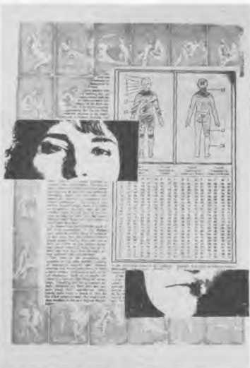
THE DIFFERENCE BETWEEN TACTILE AND VISUAL (1981) screenprint (10) 50x36 cm, 26 colours.