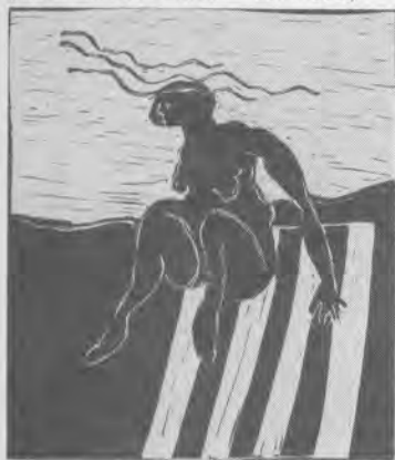
GIRL ON A BEACH linocut (4) black/white

WILLIAM WARREN Born Colac, Vic 1927. Studied GIT Geelong (Art and Design School). Uses relief printing and lithography. Has participated in a number of exhibitions and is represented in Fletcher Jones Collection, Vic; Westmead Centre Collection, NSW.