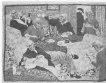
THE EMPTY CHAIR (1980) lithograph (50) 36x48 cm, eight colour plates