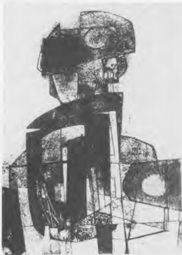
OLE (1975) aquatint (20) 45x30 cm, black/red