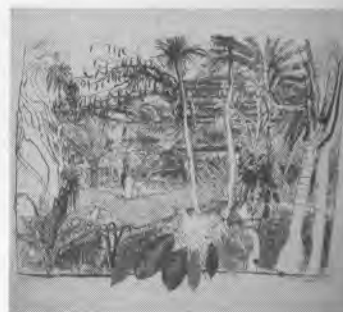
GARDEN IN SANUR, BALI (1981) screenprint with individually hand-worked leaf detail (100) 76x105 cm, 7 colours

BRETT WHITELEY Born Sydney 1939. Studied Julian Ashton Art School, Sydney 1957-9. Awarded Italian Travelling Scholarship 1960; International Prix, Paris Biennale 1961; Stuyvesant Foundation travelling grant 1964; International Prix, Internationale Der Zeichnung, Germany 1964; Perth Festival Art Prize 1964; Wardle Invitation Art Prize, Perth 1965; Harkness Foundation Scholarship 1967; Angliss Memorial Art Prize, Melbourne 1975; Archibald Prize 1977, Sulman Prize 1977 and Wynne Prize 1978 (AG of NSW). Since first solo exhibition, Matthieson Gallery, London 1962, has held one-man shows London, New York, Sydney, Melbourne. Represented: Tate Gallery; Victoria and Albert Museum; Contemporary Art Society, London; Eastbourne AG; Manchester Institute of Contemporary Art; Pembroke College, Oxford UK; Library of Congress, Washington USA; Musee d'Art Moderne, Paris; Musee des Beaux Arts, Brussels; Musee des 20 Jhrhunderts, Vienna; Stuyvesant Collections, Amsterdam; Sao Paulo Museum; National Gallery of NZ; ANG Canberra; most important Australian public and private collections. Recent publications include 'Brett Whiteley' (McGrath, pub. Bay Books, Sydney 1979).