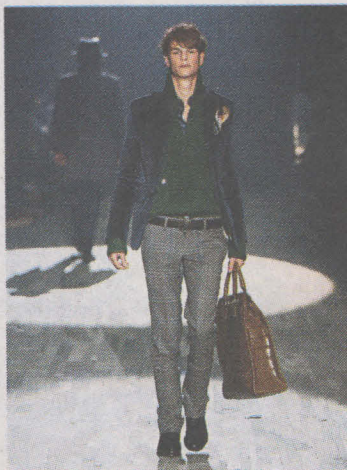
Cover photo Gucci's autumn-winter 2007/08 menswear collection.