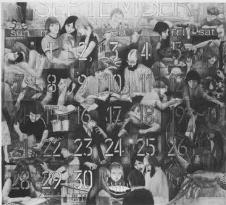
A Month In Time — Susan White. Acrylic on wood.